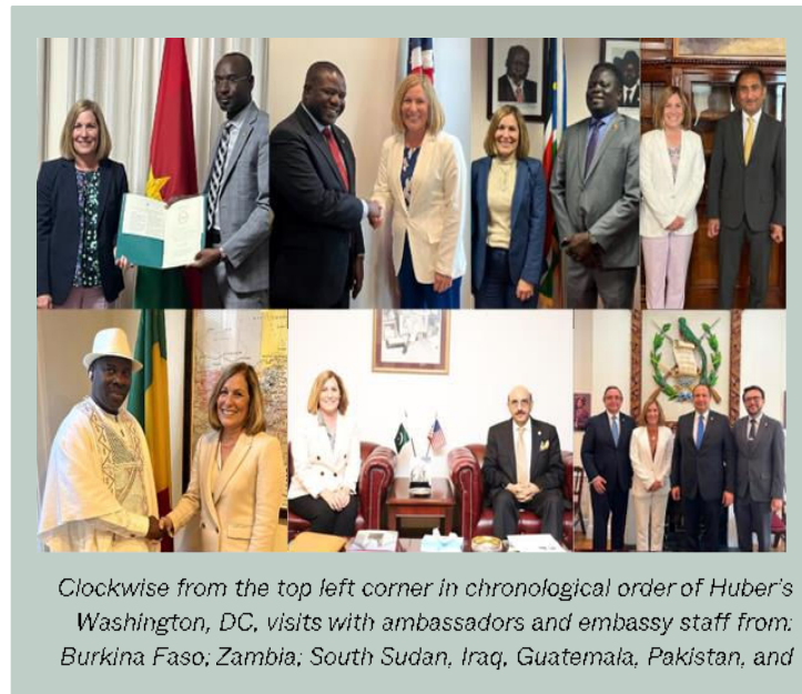
Clockwise from the top left corner in chronological order of Huber’s Washington, DC, visits with ambassadors and embassy staff from: Burkina Faso; Zambia; South Sudan; Iraq; Guatemala; Pakistan; and

In October 2023, the same month as her Guatemalan trip, Huber also traveled to Chad to meet with the Chadian prime minister, the Minister of State, the Minister of Women, Family, and Child Protection, and the Minister of Public Health and Prevention. There she presented IWH’s work that “defends human life, women’s health, solidarity, and culture and religion.” She also discussed “the significance of the [GCD]” with Prime Minister Salih Kebzabo. According to sources, the Chadian government is assessing whether to join the GCD, and it is also reviewing the Protego proposal, which would be overseen by the ministry of health. In addition to Chad, Panama and Peru may also be signing the GCD. Huber shared this update at the November 17, 2023, Transatlantic Summit V, hosted by the anti-rights group Political Network for Values in New York City at the United Nations.