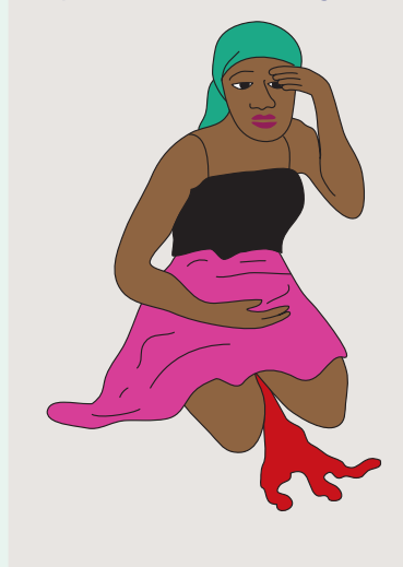
Explicit and 'shock' images

While graphic and 'shock' images may attract attention, they could cause distress and anxiety to viewers.